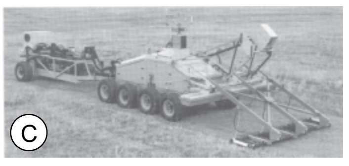
Excerpt from the Canadian NATO Industrial Advisory Group Newsletter, Issue 29, p. 19

Once the presentation and demonstrations of the more conventional modes of detection were completed, the Group turned their attention to the Improved Landmine Detector Project underway in DRES and in conjunction with Computing Devices Canada Ltd. This project is developing a teleoperated multi-sensor vehicle-mounted mine detector for low metal content and non-metallic mines for a peacekeeping role on roads and tracks.